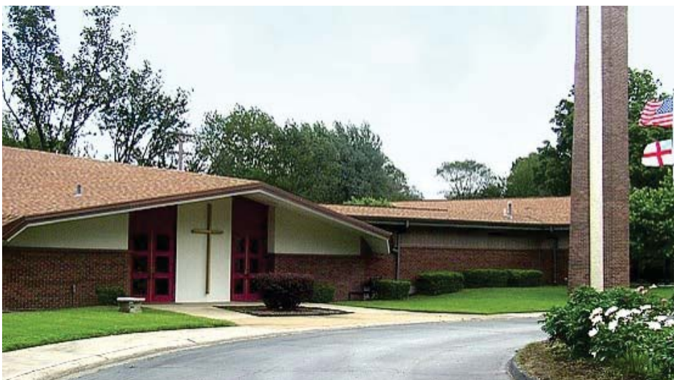
St. Barnabas' Episcopal Church from St. Catherine Street

The mission of St. Barnabas' Episcopal Church, a parish for all people, is to extend God's gracious love and hospitality to each other and to the community by providing worship that inspires, opportunities for service and growth on life's journey, and a sacred place in the heart of Florissant where people can find wholeness and