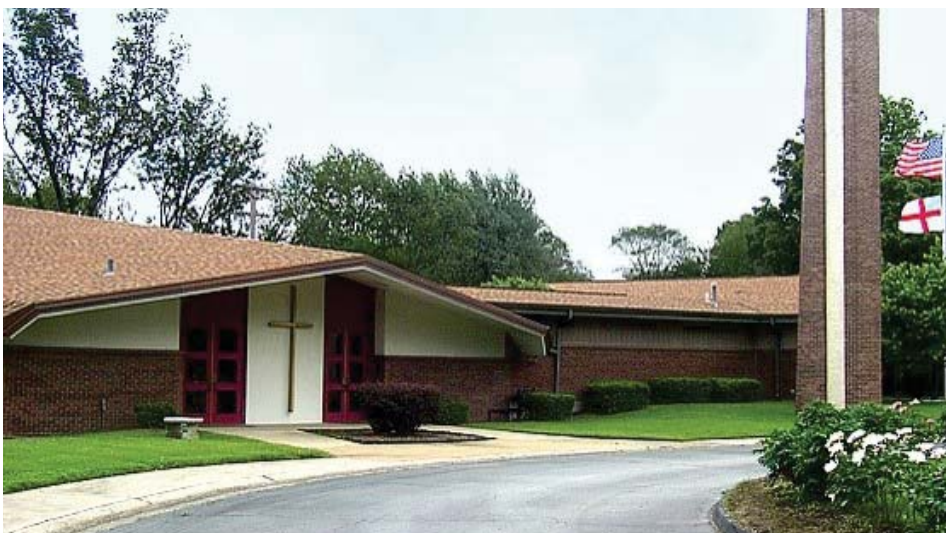
St. Barnabas' Episcopal Church from St. Catherine Street

Our vision for St. Barnabas' Episcopal Church is to build and to sustain a vibrant and diverse community centered around common worship, fellowship, service and education. The mission of St. Barnabas' Episcopal Church, a parish for all people, is to extend God's gracious love and hospitality to each other and to the community by providing worship that inspires, opportunities for service and growth on life's journey, and a sacred place in the heart of Florissant where people can find wholeness and strength.