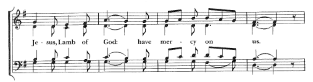
Fraction Anthem: Jesus, Lamb of God Agnus Dei